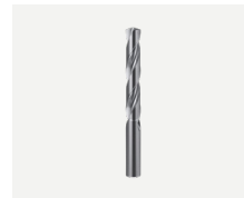
Drill Bit 10mm