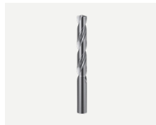
Drill Bit 8mm