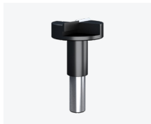
25mm Drill Bit