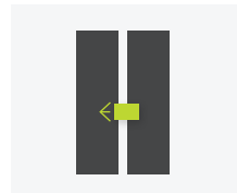
Face to Face Joint